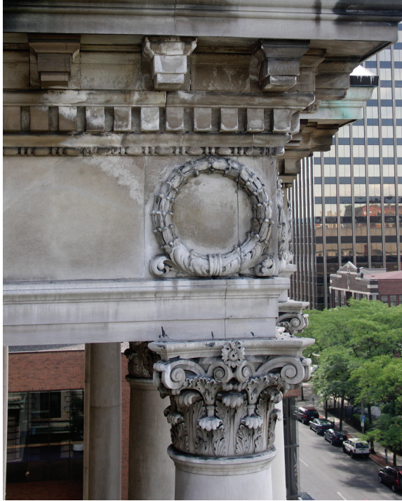
Detail of the Onondaga County Courthouse, Syracuse

Breakfast , Tiffany Ballroom, Genesee Grande Hotel