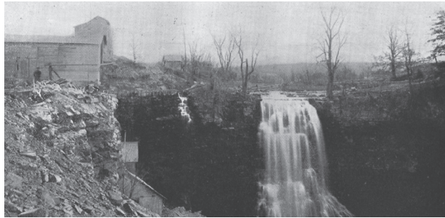
Cement Kiln and Quarry, Manlius NY circa 1900

Breakfast: Tiffany Ballroom, Genesee Grande Hotel